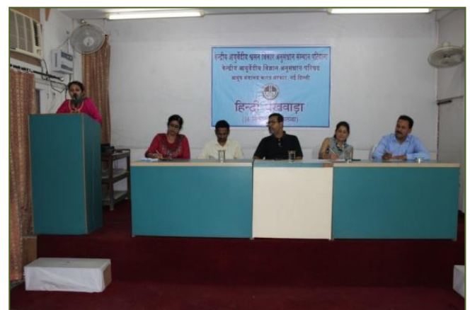
Poem Competition during Hindi Pakhwada at CARIRD, Patiala