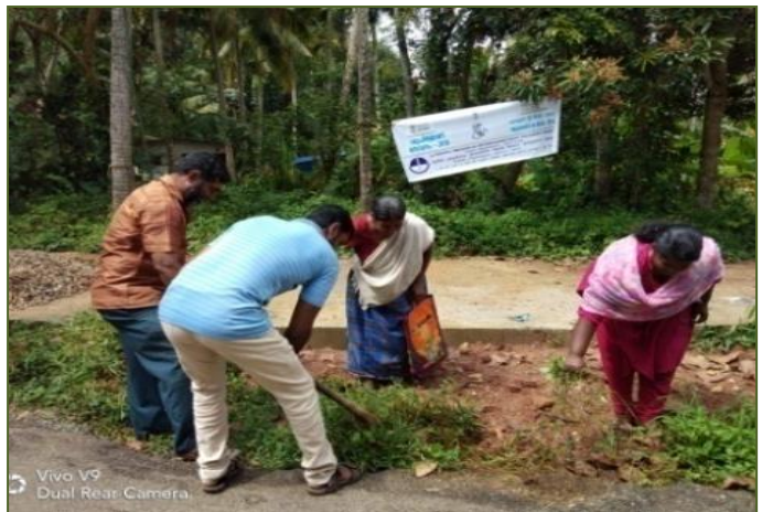
Distributing IEC materials and cleaning of streets by Staff members at RARILSD, Thiruvananthpuram