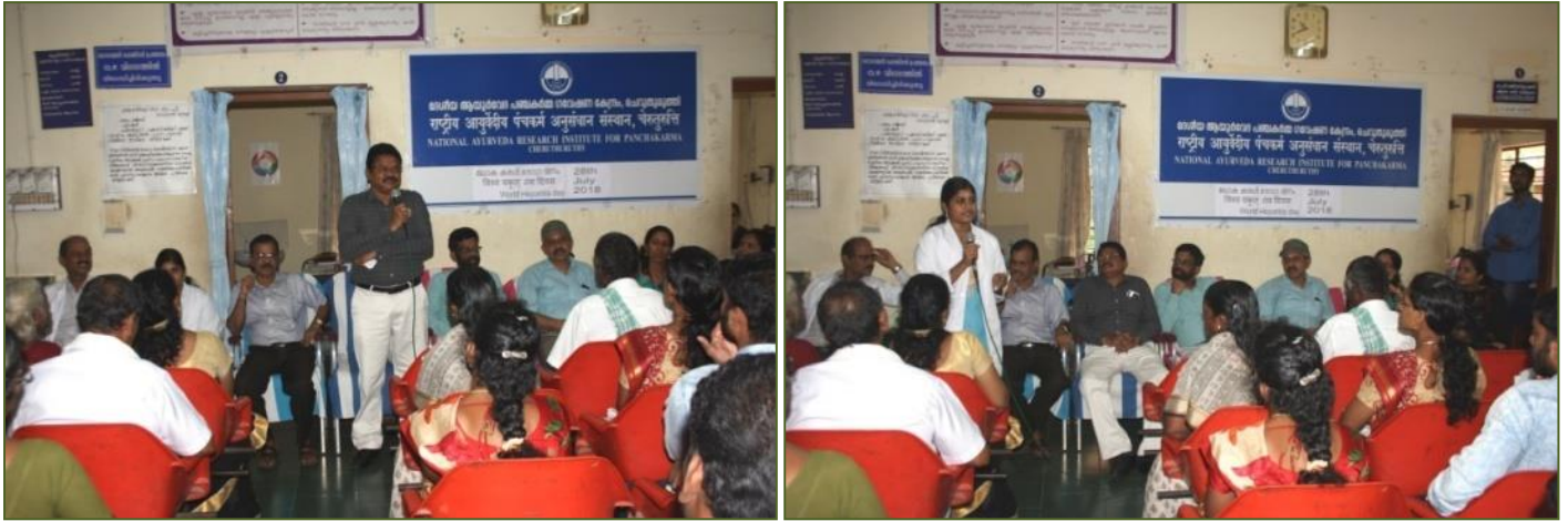
Health Awareness program on World Hepatitis Day at NARIP, Cheruthuruthy