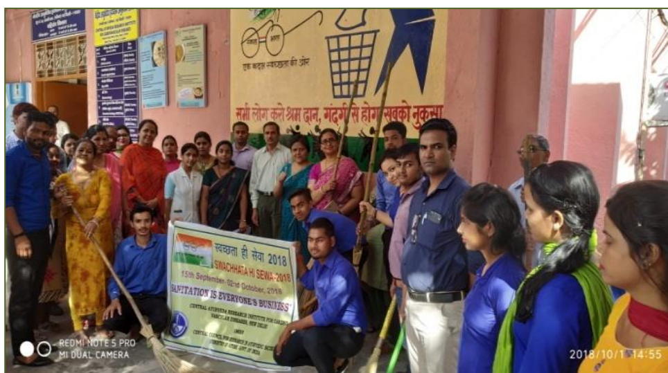
View of Officials, Staff members and students participated in Swachhata Hi Seva Campaign at CARICD, Punjabi Bagh, New Delhi

NARIP; Cheruthuruthy , organised Awareness Class on Swachhata Hi Seva conducted Swachhata Hi Seva 2018 on the occasion of 150 th birth anniversary of Mahatma Gandhi Ji and 4 th anniversary of Swachh Bharat Mission observed from 15 th September to 2 nd October in all the peripheral institutes of Council. CARICD, Punjabi Bagh , performs various activities like Cleanliness of various sections & premises of the institute, Saplings of medicinal plants were also planted in the garden. Weeding out of old files was done. A Nukkad Natak was played to propagate the importance of cleanliness & hygiene. NIIMH, Hyderabad , organized activities like rally in the colony, cleaning of surroundings of the Institute Complex and approach road by the Staff members. Under, THCRP conducted door to door meetings to drive behavior change with respect to sanitation behaviors in the selected five villages. RARILSD, Thiruvananthapuram , had organized various activities with an aim of increasing the awareness on hygiene and sanitation through OPD & outreach programmes, distribution of IEC materials, Guidance in proper waste