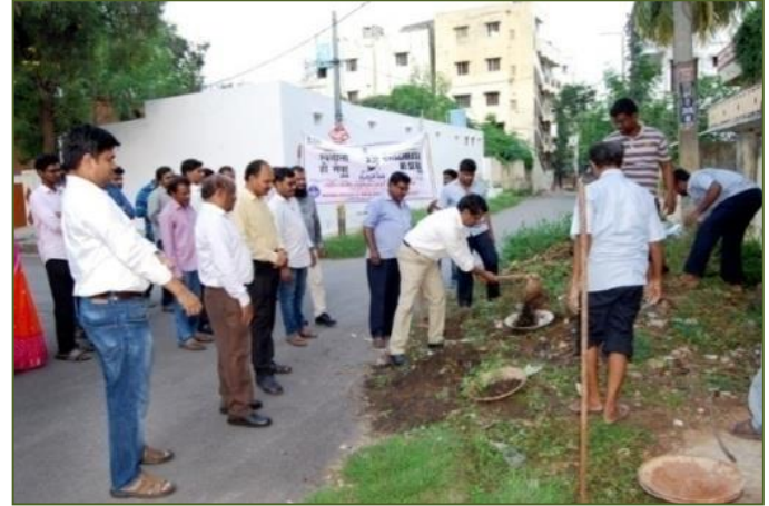
Rally on Swachhta Hi Sewa and Cleaning of surrounding institutional area by staff members at NIIMH, Hyderabad