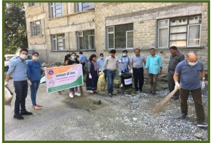
Awareness on Cleanliness under SCSP and Cleaning of surrounding institutional area by officials and staff members at RARIND, Mandi.