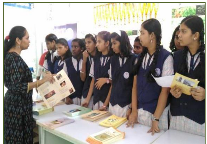
Students interacting with Research Officer and getting knowledge about Ayurveda and Medicinal Plants during the Programme

The Council has participated in the Shining Maharashtra Pune-2018 that was held during 26 th to 28 th September