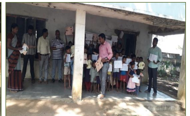
Providing Information about Poshan Abhiyan to a Pregnant Patient and Distributed Pamphlets to Teachers and students of a Zilla Parishad School at NIIMH, Hyderabad.