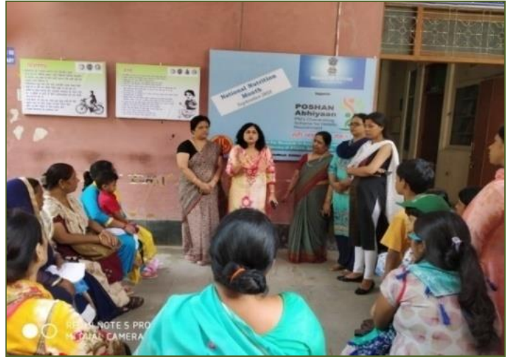
Nutritional awareness camps under Rashtriya Poshan Maah and Poshan Abhiyan at CARICD, Punjabi Bagh