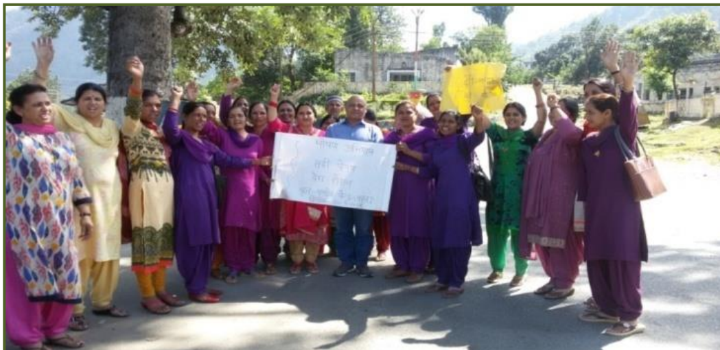
Rally on Nutrition Campaign by Woman Circle Pandoh with In-charge Assistant at RARIND, Mandi