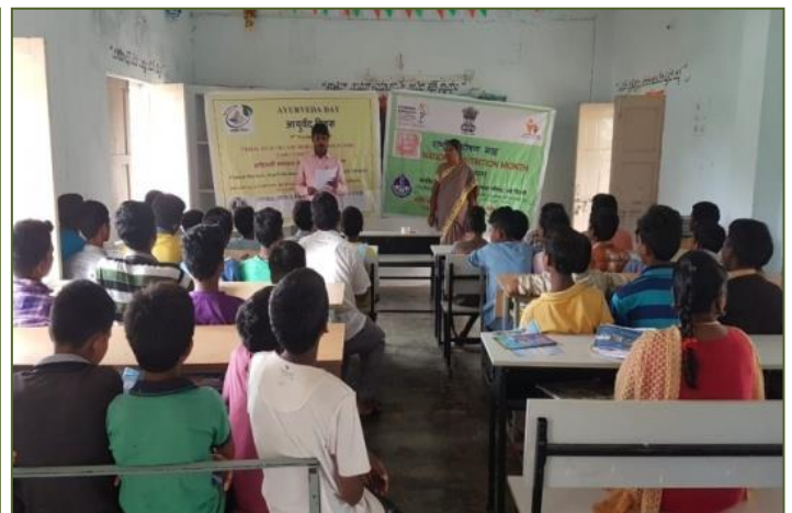
RARISD, Vijayawada has created awareness regarding nutrition and hygiene aspects to the Childrens and Teaching staff of Various Schools.