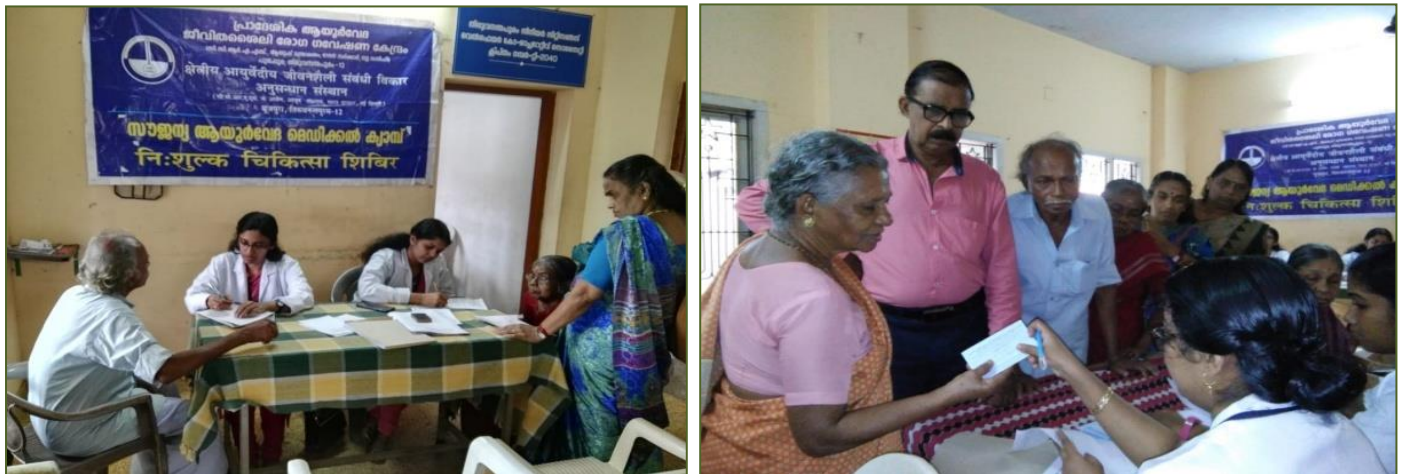
RARILSD supported the flood affected people by providing essential health care and relief materials

Contributing to the cause of flood affected areas, the Council supported patients and families in need through the initiative #Keralafloods 2018 –We Shall Overcome. Besides providing essential health care the Regional Ayurveda Research Institute for Lifestyle Related Disorders (RARILSD), Thiruvananthapuram also collected relief materials for the needy.