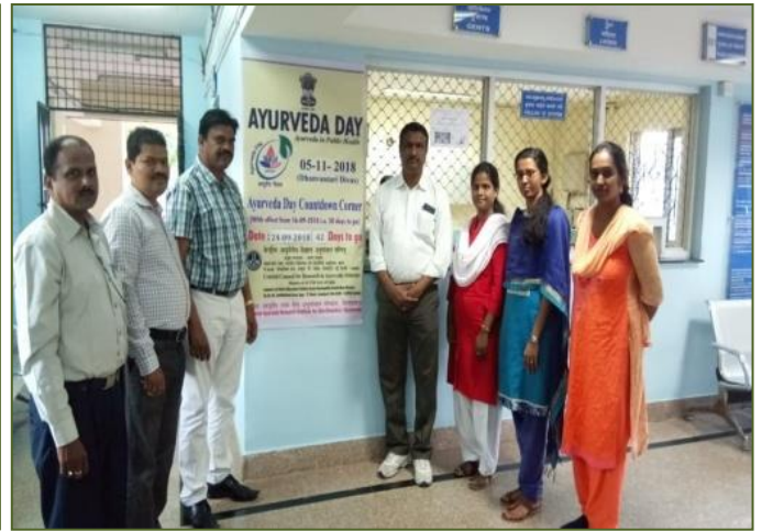
Ayurveda Day Countdown Celebrations at RARISD, Vijayawada