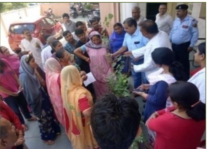
The Institute is celebrating 3 rd Ayurveda Day and Sapling distribution at MSRARIED, Jaipur.