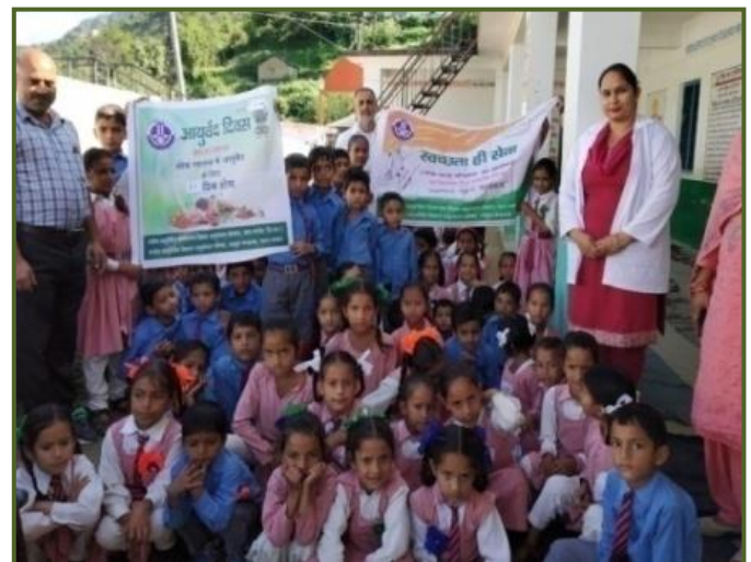
Ayurveda Day Countdown, Under the Scheduled Castes Sub Plan and Ayurveda Health-Rescue Program at RARIND, Mandi