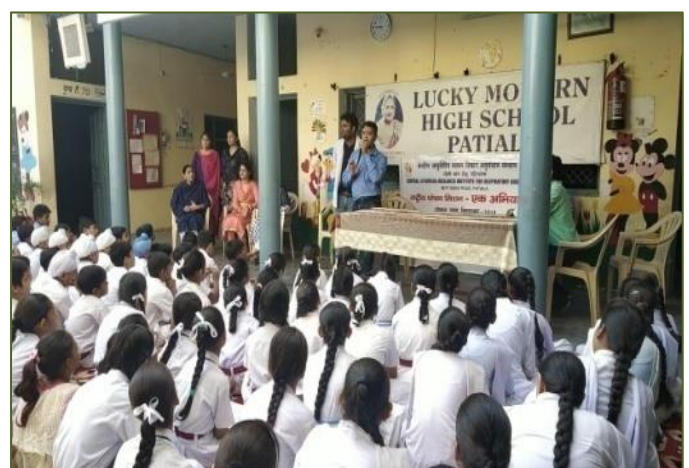
Public Awareness Program on “Nutritional Awareness in Parents for how to promote children’s health” at CARICD, Punjabi Bagh OPD (RIGHT) A lecture delivered at school level during Poshan Maah.

Rashtriya Poshan Maah has been observed from 15 th to 30 th September 2018. Awareness classes on nutritional related topics to the patients/ common public and in the the outreach programmes have been conducted in all the peripheral institutes of Council. Reports were received from: