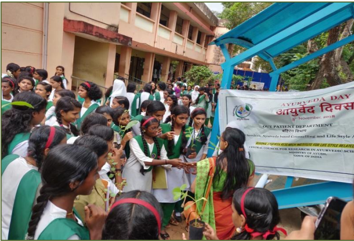
Medicinal plants distribution for school children at RARILSD, Thiruvananthapuram