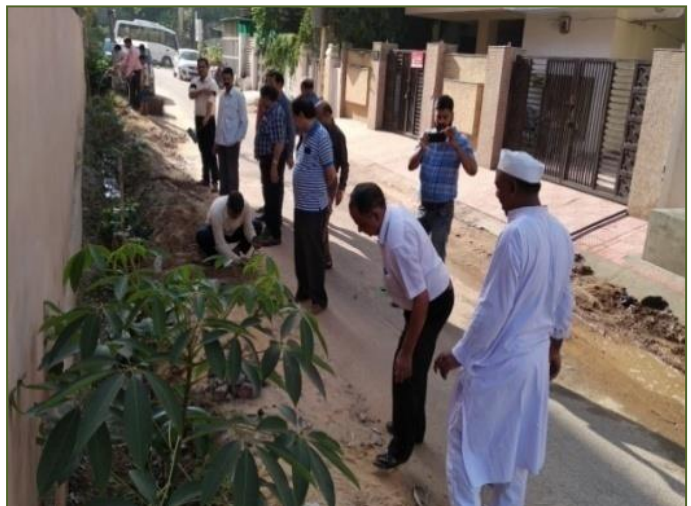
Officials and Staff members took pledge of Cleanliness and cleaning the institute surroundings at MSRARIED, Jaipur