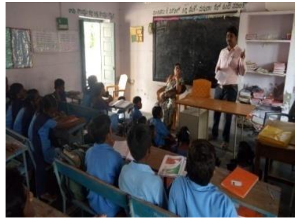
Health Programmes conducted under SRP and SCSP Programs at RARISD, Vijayawada