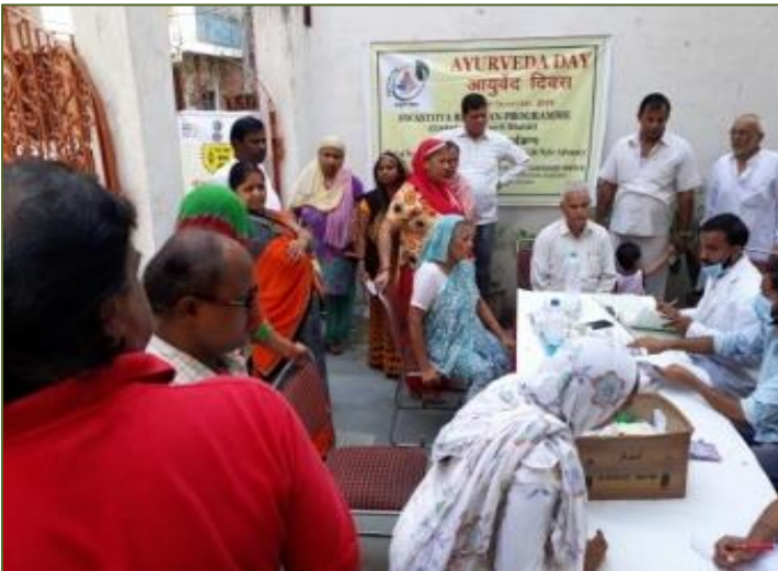
Medicinal Plants distribution and Medical camps conducted through the outreach activities of the institute (SCSP & SRP) at CARICD, New Delhi