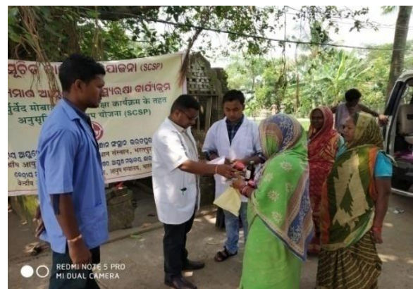
Tribal Health Care Research Programme and Health Care Programme under SCSP at CARIHD, Bhubaneswar