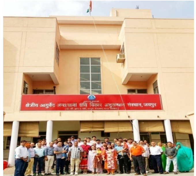
All the Officials and Staff members of MSRARIED, Jaipur on the occasion of 72 nd Independence Day