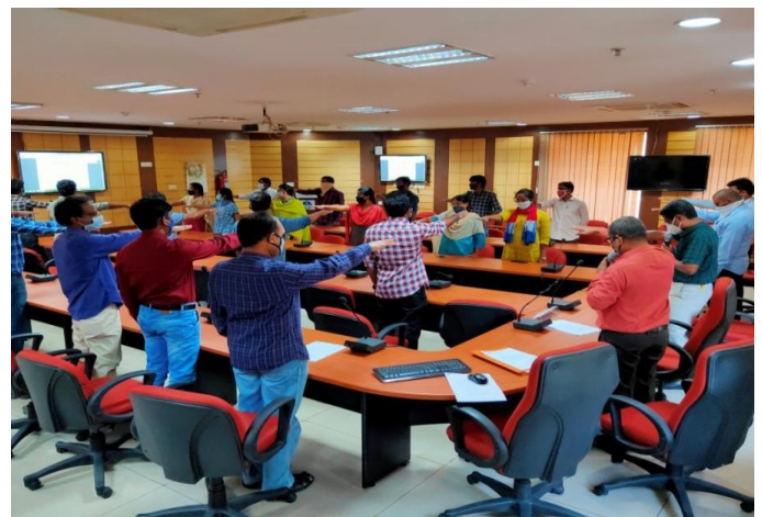
View of all the Officers and staff taking Pledge on Inaugural ceremony of Vigilance Awareness week on 27 th October, 2020