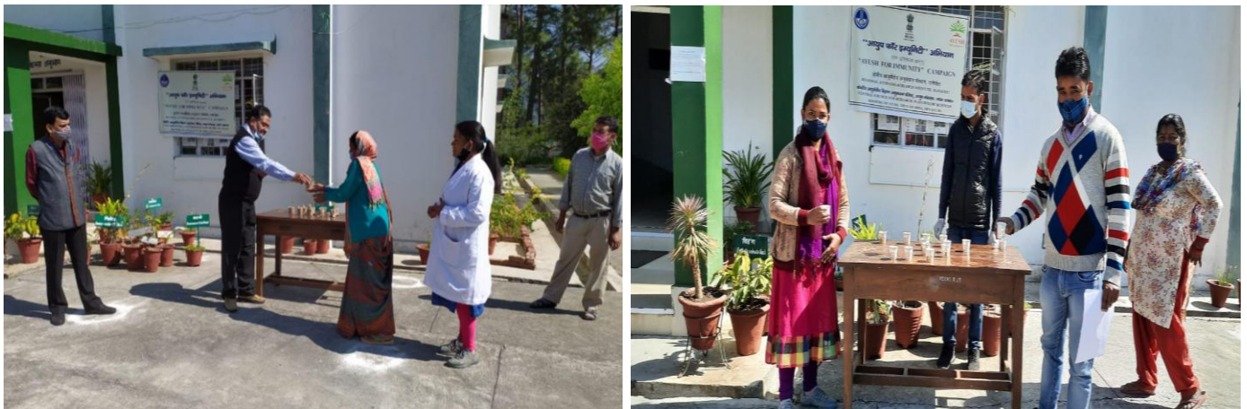
Free saplings of Medicinal plants and AYUSH Kwath distributed among patients as a part of AYUSH for Immunity Campaign at RARI, Ranikhet

Under the 'Ayush for Immunity' campaign a banner regarding the campaign was placed in the OPD premises for information to the patients. As a part of this campaign, various activities were organized including Sensitization of patients for Immunity through Public lectures, Medicinal plants exhibition in the OPD premises, free distribution of Ayush Kwatha among patients and staff, distribution of Saplings of medicinal plants to the patients attending the OPD. Free IEC materials were also distributed among patients.