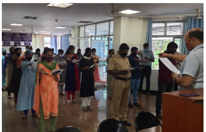
View of pledge taken on the preamble of Indian Constitution at RARI, Thiruvananthapuram