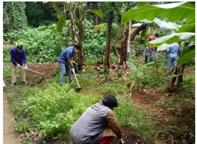
Cleaning of institute premises as a part of Swachhatha Pakhwada at NARIP, Cheruthuruthy.