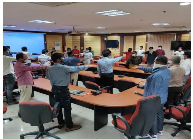
View of all the Officers and staff taking Swachhata Pledge at NCIMH, Hyderabad on 16 th October, 2020