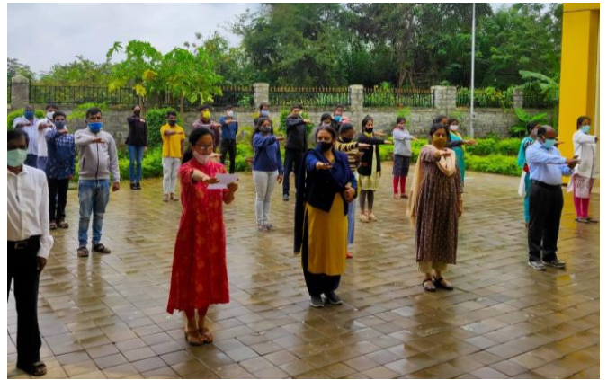
Officers and staff taking pledge during Constitution Day on 26 th November, 2020 at CARI, Bengaluru.