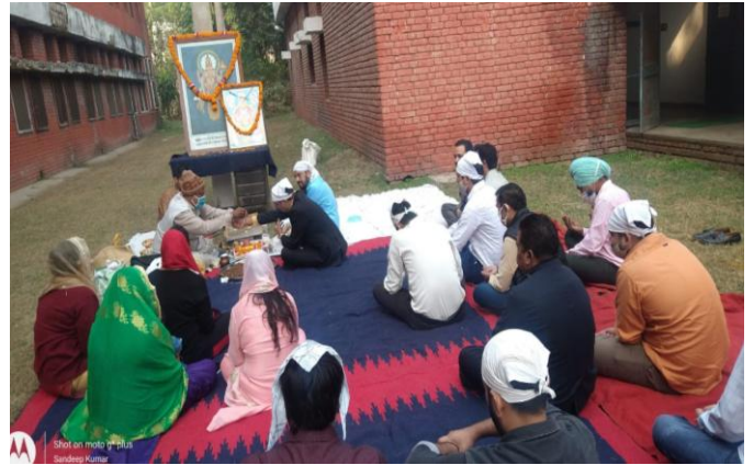
Glimpse of Dhanvantari pooja performing by Director (Institute) along with officers and staff on the occasion of Ayurveda Day at CARI, Patiala