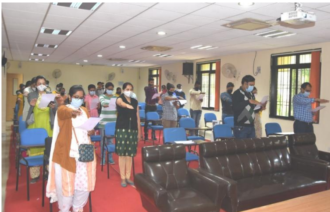
All officers and employees of RARI, Pune, reading the preamble of the Constitution of India by taking pledge