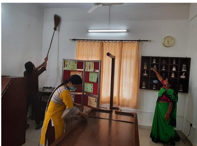
View of cleaning of different sections of the institute by active participation of all Officers and Staff at RARI, Ranikhet.