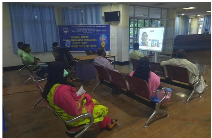
Officers during Webinar on 'The Relevance of Ayurveda in the current scenario of COVID-19 pandemic' organized on the occasion of 5 th Ayurveda Day at RARI, Thiruvananthapuram