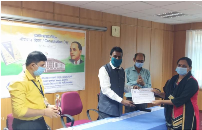
Awarding the winners of the essay competition during the Constitution Day celebrations at NARIP, Cheruthuruthy