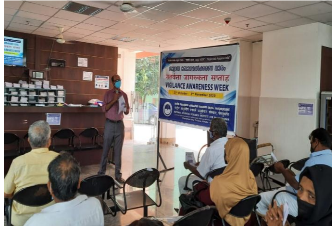
View of conducting awareness session during Vigilance awareness week at NARIP, Cheruthuruthy