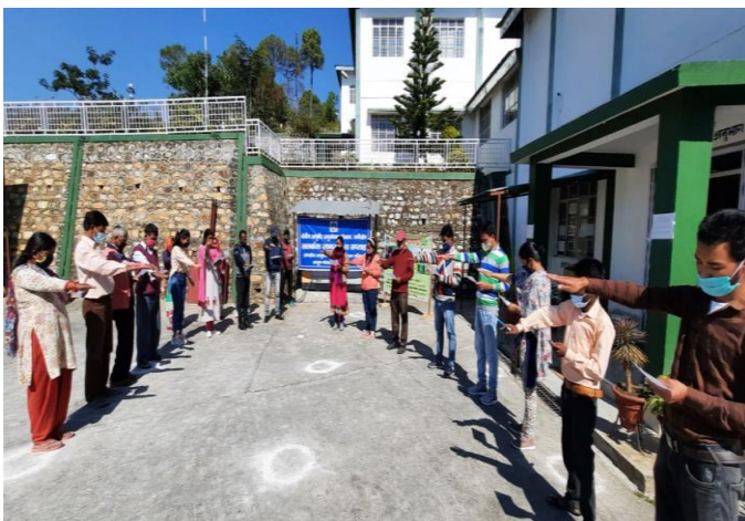
Pledge taking by RARI, Ranikhet Staff on the occasion of Vigilance Awareness Week