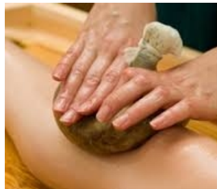
Patra pinda swedana