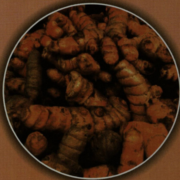
Haridra ( Curcuma longa )