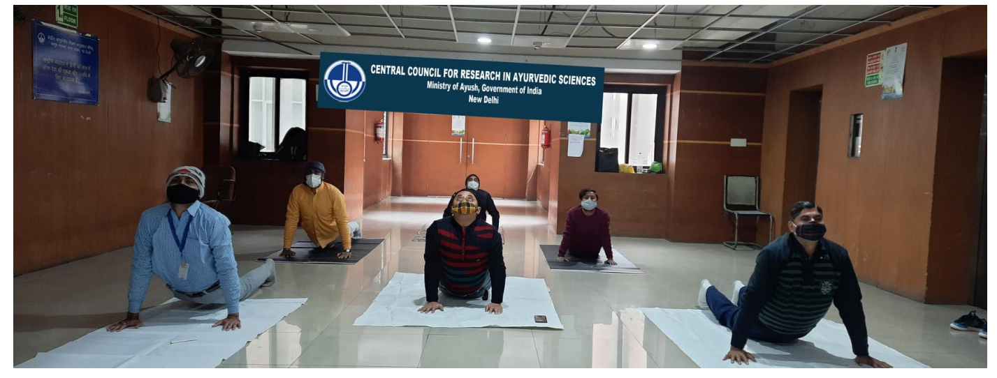
Glimpse of Officials and staff performing Yogasanaon the occasion of Suryanamaskar Mass Demonstration organized under AzadikaAmritMahotsav celebrations on 14<sup>th</sup> January, 2022 at CCRAS Headquarters, New Delhi.

To mark the holy occasion of Makar Sankranti on 14<sup>th</sup> January 2022 under Azadi ka Amrit Mahotsav celebrations, CCRAS along with all the peripheral institutes participated in the event of large scale virtual Surya Namaskar organized by Ministry of Ayush. Glimpse of some of the activities are: