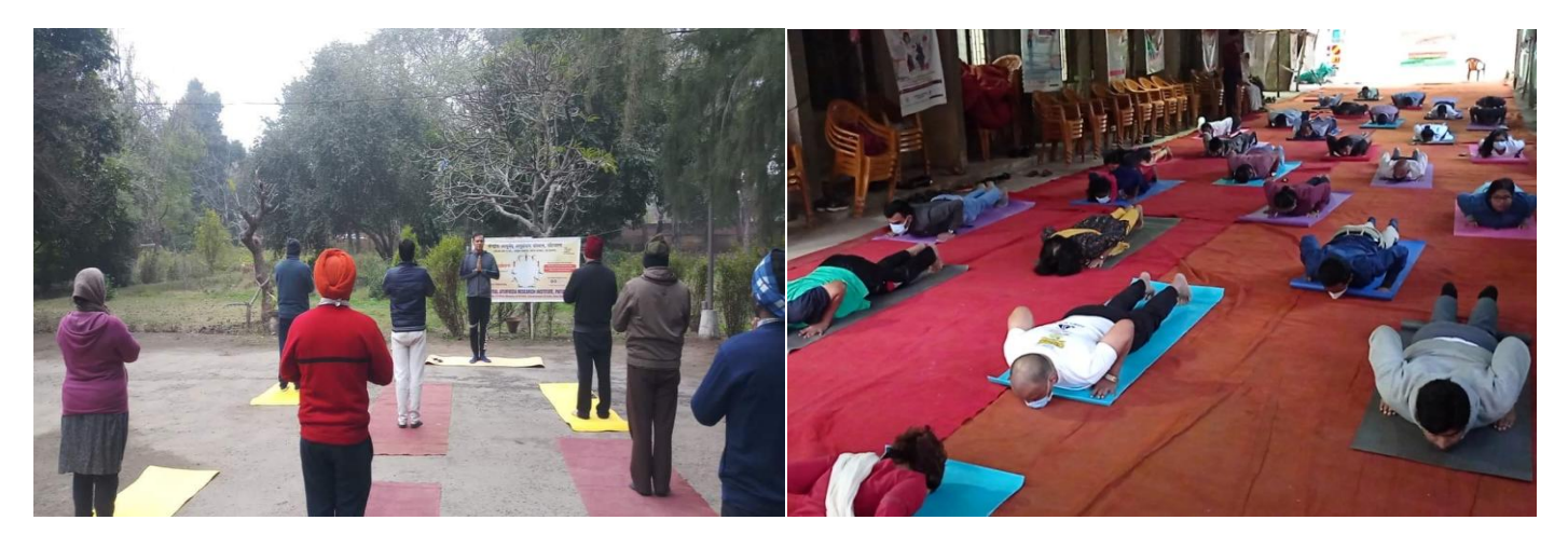
Officers and Staff of CARI, Patiala performing yogasanas during the event of Suryanamaskar Mass Demonstration.