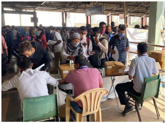
Distribution campaign for Ayush Prophylactic medicines for Covid-19 organized at Dadar Railway station by RRAP-CARI, Mumbai on 05<sup>th</sup> February, 2022.