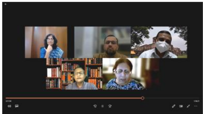
Glimpse of four days online training programme on 'Capacity building of CCRAS Scientists on Research Integrity and Publication Ethics' organized by RARI, Pune from 18<sup>th</sup> January, 2022 to 21<sup>st</sup> January, 2022

CCRAS organized a four days online short term training programme on 'Capacity building of CCRAS Scientists on Research Integrity and Publication Ethics' jointly in collaboration with Centre for Publication Ethics and Centre for Complementary and Integrative Health (CCIH), Savitribai Phule Pune University to its 330 Scientists in 3 Batches. RARI, Pune was designated as a nodal institute for the training programme and the training was conducted from 18<sup>th</sup> - 21<sup>st</sup> January, 2022; 22<sup>th</sup> - 25<sup>th</sup> February, 2022 and 8<sup>th</sup> - 11<sup>th</sup> March, 2022.