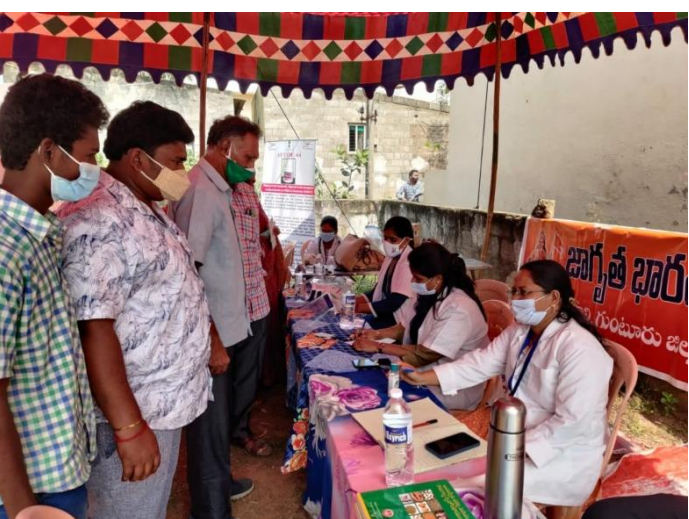
Glimpses of Prophylactic medicine distribution to the Prophylaxis medicine and IEC material distribution at January, 2021