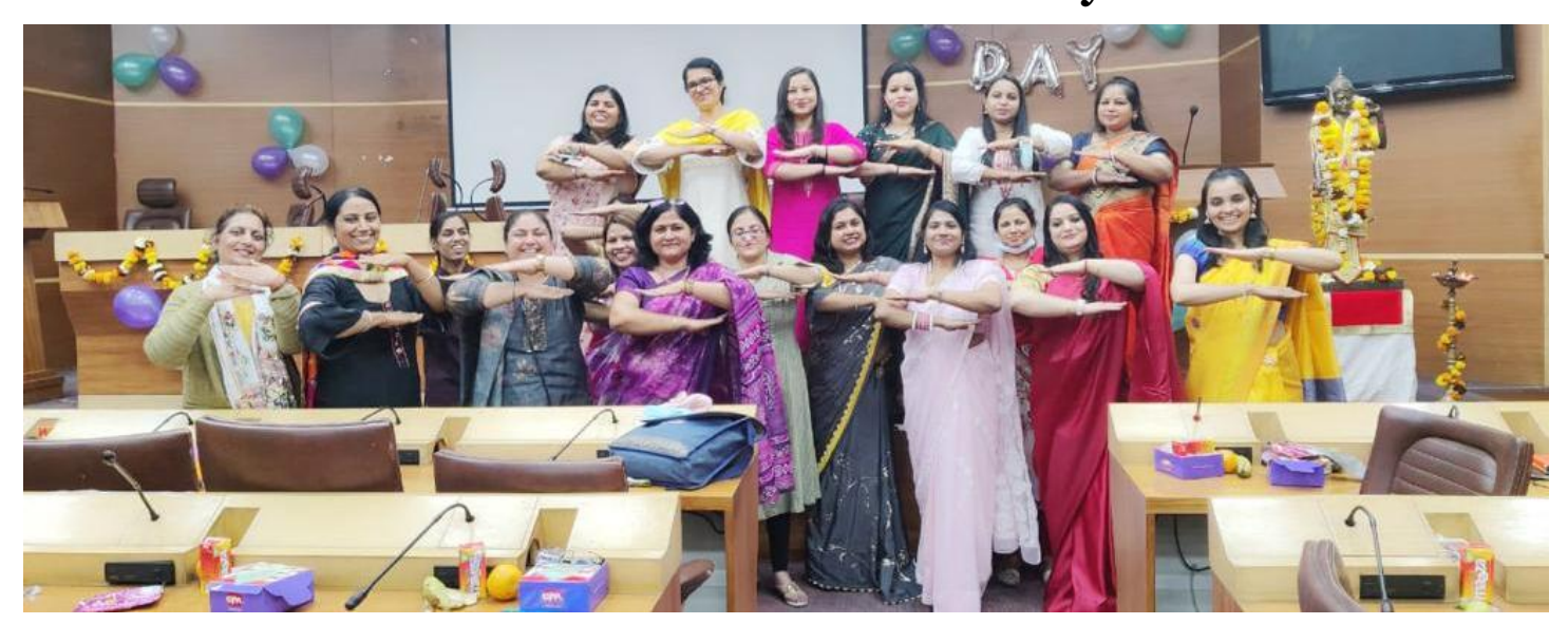
Glimpses of International Women's Day Celebrations at CCRAS, Headquarters, New Delhi

International Women's Day is celebrated on 8th March every year. To mark the celebration, the Council observed International Women's Day on 10<sup>th</sup> March, 2022 at CCRAS Headquarters, New Delhi. The event was planned around the theme of 'Gender equality today for a sustainable tomorrow', with the goal of