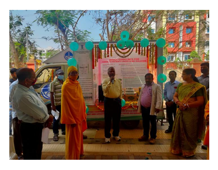
A vehicle campaign organized at CARI, Bhubaneswar for the distribution of prophylactic medicines as a part of large scale prophylactic medicine distribution on 09<sup>th</sup> March, 2022.

In the continuing series of activities to distribute prophylactic medicines and diet and lifestyle guidelines with special focus on geriatric population under the 'Azadi Ka Amrit Mahotsav', CCRAS along with all the periphery institutes organized various events for its distribution. Glimpse of some of the activities are: