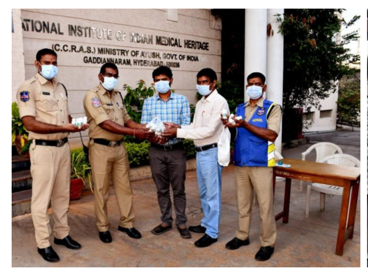
residents of RVB Colony & Malakpet police staff personnel Chinakakani, Mangalagiri, Andhra Pradesh by RARI organized as a part of Azadi ka Amrit Mahotsava by NCIMH, Vijayawada under Azadi ka Amrit mahotsava on 29th Hyderabad on 03<sup>rd</sup> February, 2022