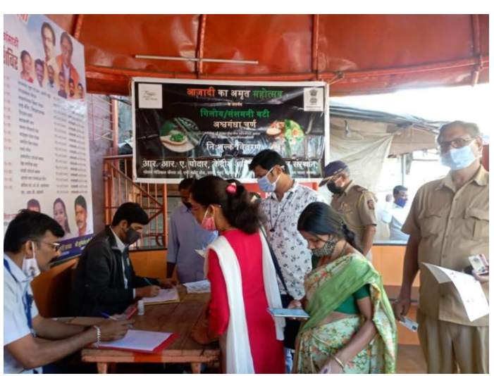
A camp organized for the distribution of Prophylactic medicines by RRAP CARI, Mumbai at Worli Koliwada, Mumbai on 31<sup>st</sup> January, 2022.