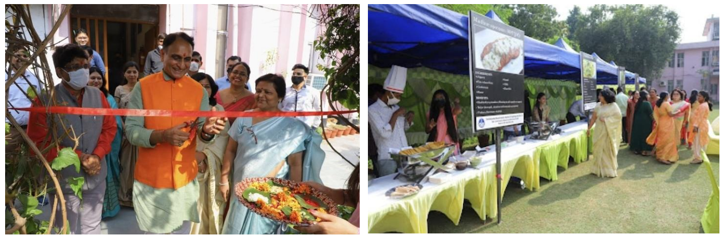
Glimpse of inauguration of 'Food Festival' organized as a part of 6th Ayurveda Day celebration by Hon'ble Member of Parliament, Prof. Rakesh Sinha, at CARI, New Delhi