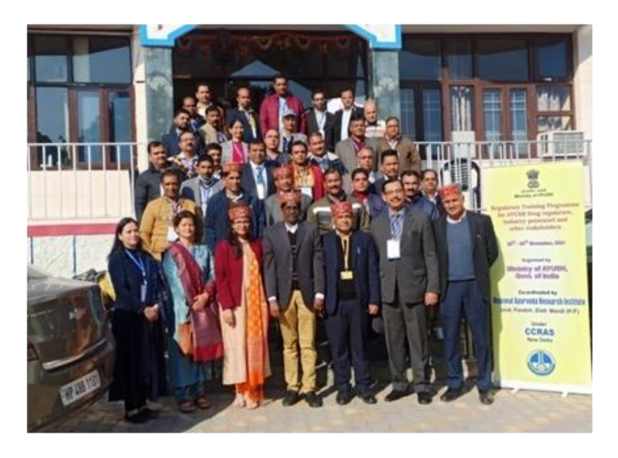
Glimpse of participants of the two days Regulatory training program for Ayush Drug regulators, Industry personnel, & other stakeholders held during 25-26 November, 2021 co-organized by RARI, Mandi

Two days Regulatory training program for Ayush Drug regulators, Industry personnel, & other stakeholders was held during 25^{th} - 26^{th} November, 2021 co-organized by RARI, Mandi in collaboration with Drug