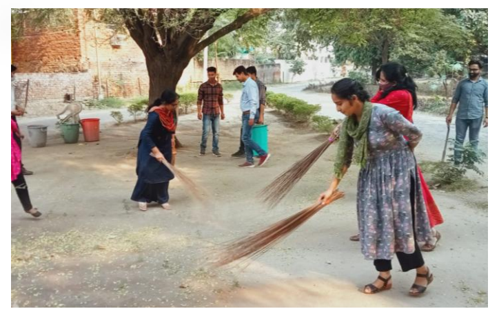
All the officers and staff of CARI, Patiala, cleaning the surroundings of the institute as a part of Swachhata Pakhwada