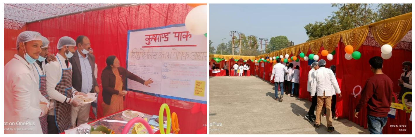
View of AYUSH food festival organized by RARI, Lucknow