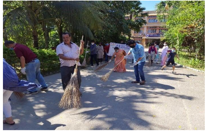
Cleaning of institute premises as a part of Swachhatha Pakhwada at CARI, Guwahati