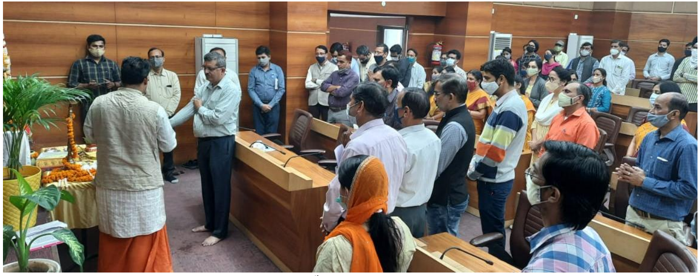
Glimpse of Dhanvantari Pujan on the occasion of 6<sup>th</sup>Ayurveda Day celebration at CCRAS Headquarters, New Delhi

Council observed 6<sup>th</sup> Ayurveda Day on the occasion of Dhanwantari Jayanti on 2<sup>nd</sup> November, 2021 with the theme 'Ayurveda for Poshan'. Various activities were organized to mark the occasion at Council's Headquarters, New Delhi and its peripheral institutes all over India. Glimpses of some of the activities are: