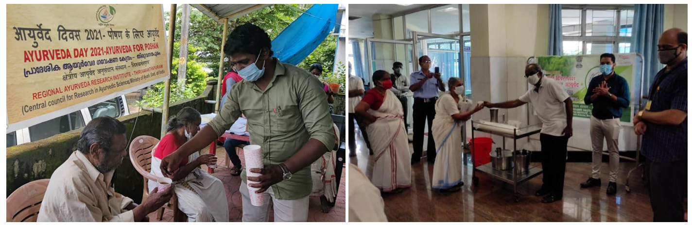
As a part of Ayurveda Day 2021 celebration, Regional Ayurveda Research Institute, Thiruvananthapuram distributed 'Chinchapanakam' - An appetizer and a health promoting drink for the public in OPD and at Karakulam Panchayath.