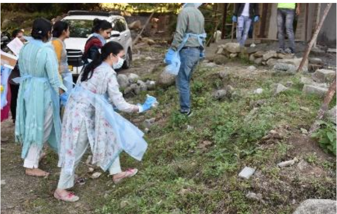
View of cleanliness drive organized at RARI, Mandi as a part of Swachhata Pakhwada