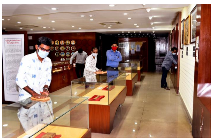
View of cleaning of Museum as part of Swachhata Pakhwada at NCIMH, Hyderabad on 21<sup>st</sup> October, 2021