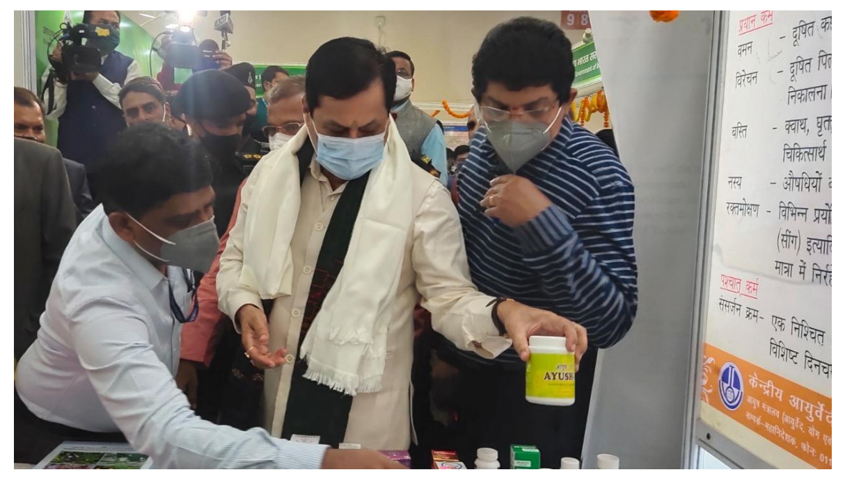
Visit of Ayush Minister Shri Sarbananda Sonowal to CCRAS pavilion on 23<sup>rd</sup> Nov 2021at 40th IITF, PragatiMaidan, New Delhi.

CARI New Delhi, on behalf of CCRAS participated in 40<sup>th</sup> International Trade Fair (IITF) at Pragati Maidan, New Delhi from 14<sup>th</sup> November, 2021 to 27<sup>th</sup> November, 2021 organized by India Trade Promotion Organization (ITPO). During the event, display stalls were arranged for the visitors in which Council's publications & Council's activities were displayed and free brochures distributed to the visitors for publicity. Free medical check-up camp was also organized to provide medical consultation and free prophylactic medicines were distributed. Around 1600 people visited the stall.