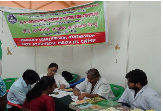
Free Medical Ayurveda camp on 26-29 September 2014 at TIRUVALLURU- Tamilnadu..