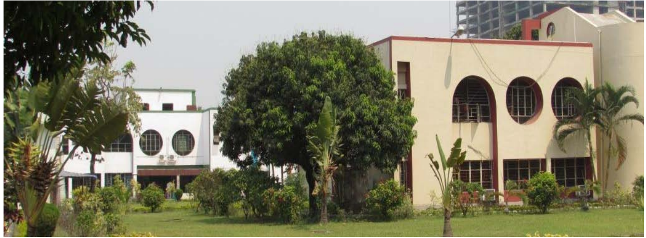
View of NRIADD premises, Kolkata

Background and mandate of the Institute: This institute was established in the year 1972 as Regional Research Institute (Ay) and shifted to its own building at CN Block, Sector- V, Salt Lake City, Kolkata in the year 1997. The 3 acres land was provided by the Government of West Bengal free of cost. This Institute was upgraded as Central Research Institute (Ay.) in the year 1999. Again it was upgraded as National Research Institute of Ayurvedic Drug Development in the year 2009. This Institute has basic facilities for research in literature, drug and clinical trial in Ayurveda and allied disciplines. Different departments such as Hospital (IPD & OPD), Pathology & Bio-chemistry, Pharmacognosy, Chemistry, Pharmacology, Pharmacy etc. are major component of this Institute. The institute is functioning on focused mandates like 1. Development of safe, effective and affordable Ayurvedic drugs. 2. Development of standards for identification, collection and storage of raw materials. 3. Development of SOP for various classical and investigational new drugs (IND) etc.