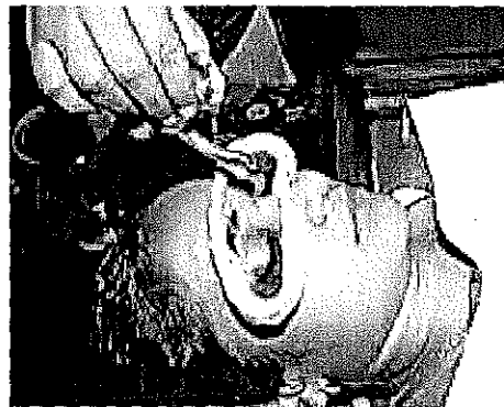
Pictures showing Ayurvedic procedure ( Kriya-kalpa ) (specific eye procedures like Tarpana , Aschyotana )